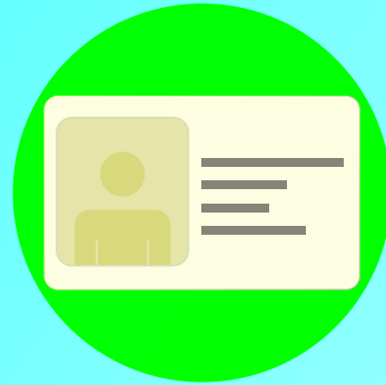
Lichtbild- ausweis Photo Id