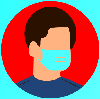
Medizinische Maske Medical Face Mask